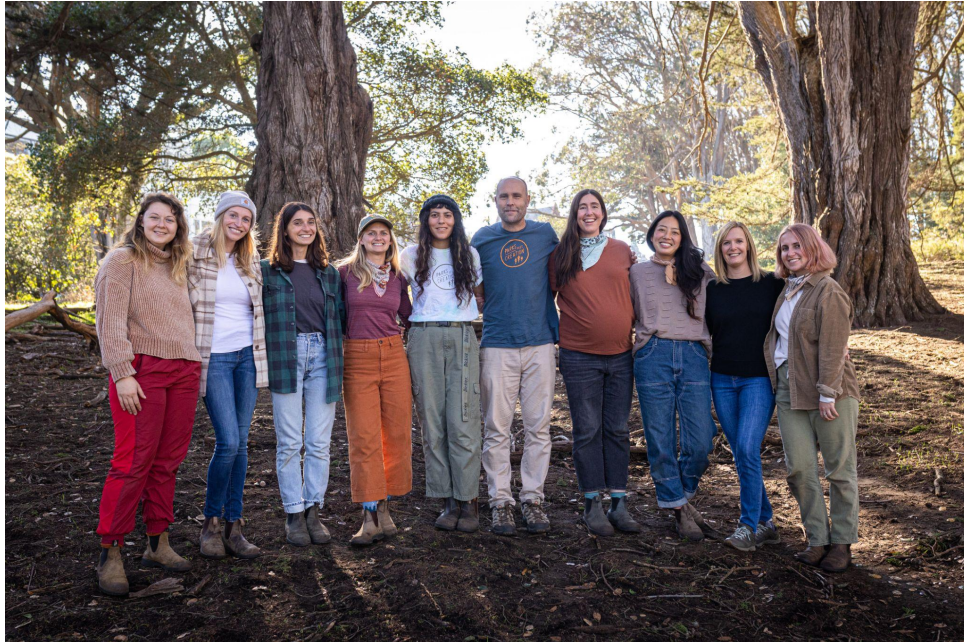
Spire School Teachers & Staff

Please don't hesitate to reach out to us if you need additional information. You can email us at parkspluscreation@gmail.com